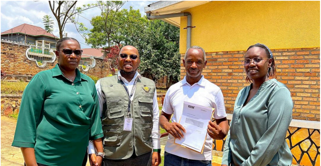
In this photo: The Vice Mayor in charge of Social Affairs for Huye District, together with the Executive Secretary of Ngoma Sector, receiving medical insurance (Mutuelle de Santé) for 80 vulnerable citizens from the Executive Director of Helping Heart Family Rwanda.

On September 24, 2024, Helping Heart Family Rwanda carried out an impactful support initiative in Huye District, Ngoma Sector. The activity focused on strengthening the well-being of vulnerable families by improving access to health services and education key pillars for sustainable development and social integration.