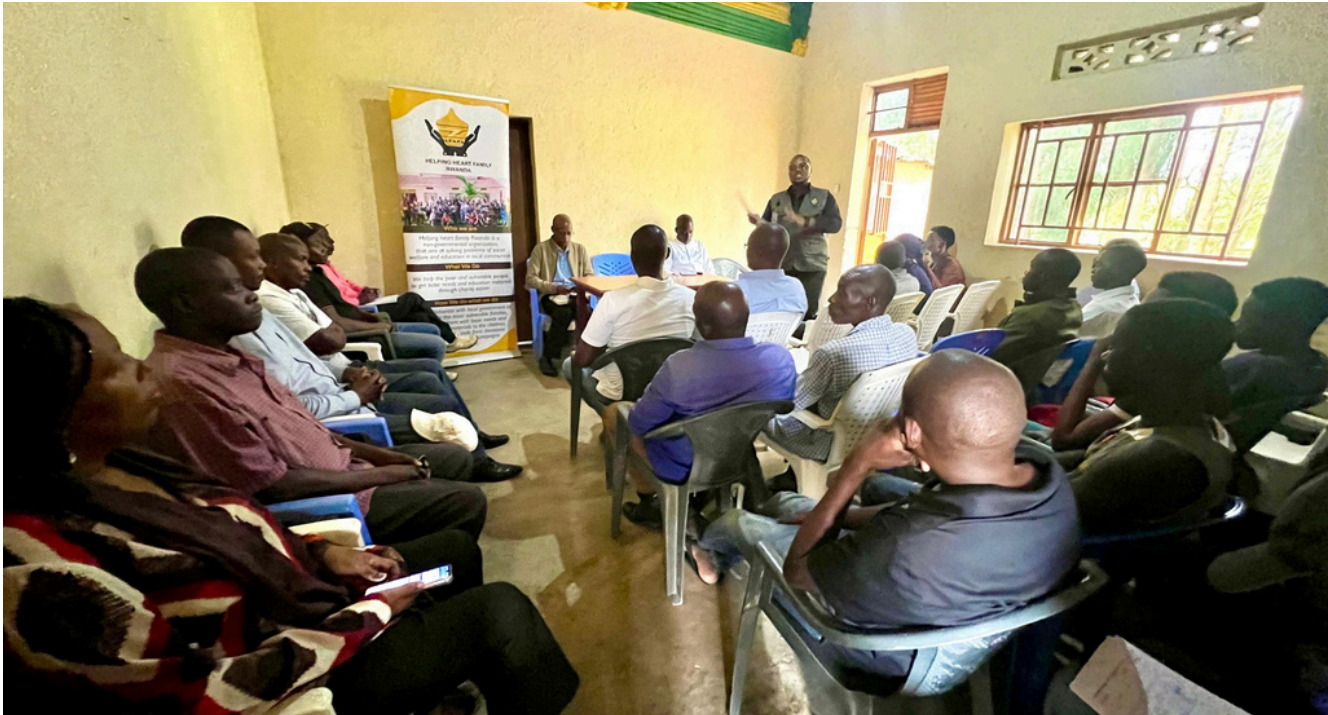
Photo: Community members participating in the GBV awareness session during the 16 Days of Activism in Nyarutarama, November 26, 2024..

As part of our ongoing efforts to combat Gender-Based Violence (GBV) and promote community awareness, Helping Heart Family Rwanda officially launched the 16 Days of Activism campaign on November 26, 2024. The campaign commenced with a GBV Awareness session held at Inteko y'Abaturage in Nyarutarama Cell, Remera Sector, bringing together over 100 community members, including local leaders, youth, and parents.