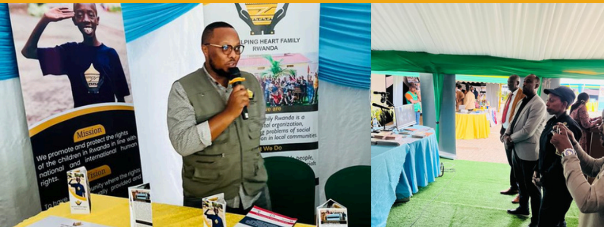
Photo: The Executive Director of Helping Heart Family Rwanda explaining various HHFR projects to Executive Administrator (DEA) of Gasabo District and other local leaders.

Importantly, the exhibition provided a unique opportunity for our team to explain in detail the concept of “Ubutabera Buhera mu Muryango” (Justice Begins Within the Family), a key initiative of Helping Heart Family Rwanda. We engaged with community members, local leaders, and other visitors, highlighting how justice, legal awareness, and conflict resolution at the family level are essential foundations for building stronger, more resilient communities.