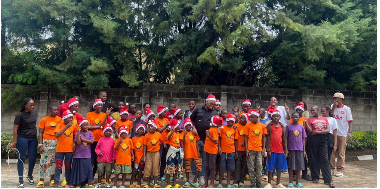
Photo: Children from the Tumurere Yize program enjoying the Christmas celebration organized by Helping Heart Family Rwanda at Never Again Huye, December 21, 2024.

On December 21, 2024, Helping Heart Family Rwanda (HHF Rwanda) hosted a heartwarming Christmas celebration for children under the Tumurere Yize program at Never Again Huye. The day was filled with laughter, joy, and togetherness as we engaged in fun games, shared meals, and gifted over 80 children, reminding them that they are valued, loved, and cherished.