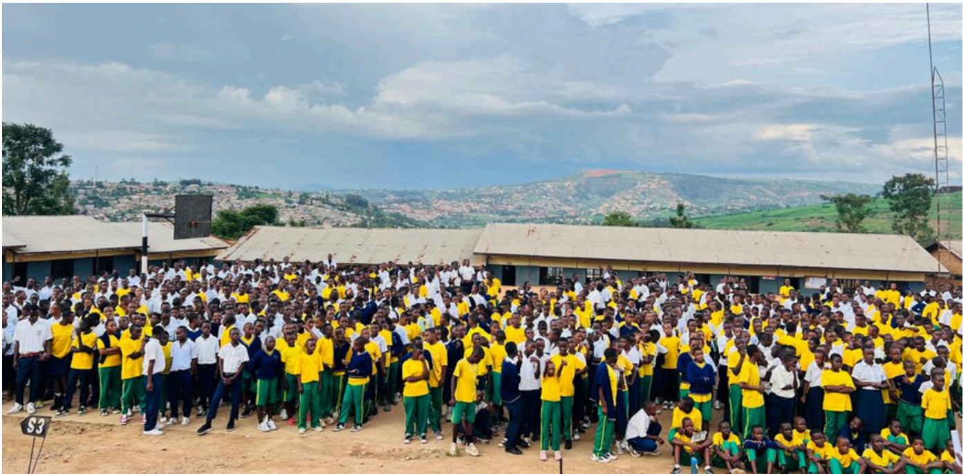
Photo: Students of G.S Kagugu participating in the GBV awareness session during the 16 Days of Activism, November 27, 2024.

On November 27, 2024, as part of the 16 Days of Activism Against Gender-Based Violence, Helping Heart Family Rwanda conducted an awareness campaign at G.S Kagugu in Kinyinya Sector, Gasabo District, educating over 2,000 students and their teachers on Gender-Based Violence (GBV), its forms, consequences, and prevention measures. The session included interactive discussions, real-life case studies, and participatory activities that encouraged students to challenge harmful gender norms, speak out against GBV, and advocate for safer school environments. Teachers were also equipped with knowledge on identifying GBV cases, supporting survivors, and fostering a protective learning space. Emphasizing the importance of preserving evidence and understanding reporting procedures, the training strengthened the role of schools in combating GBV. Helping Heart Family Rwanda remains committed to promoting gender equality, child protection, and empowering youth to take action against GBV in their communities.