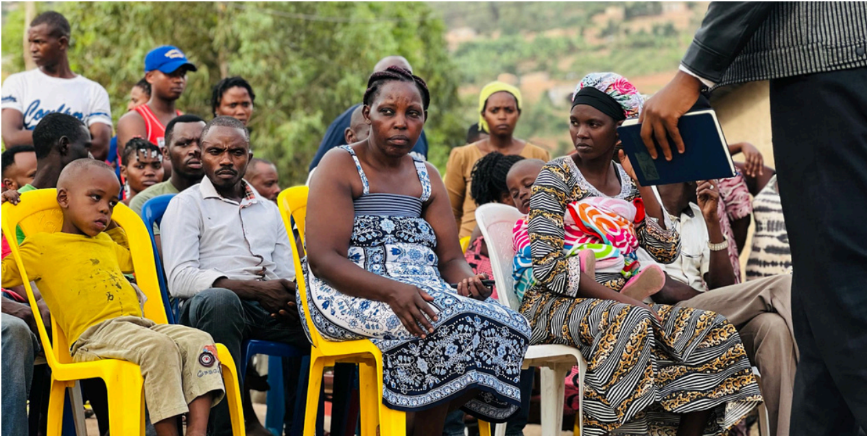
Photo: Community members attending Inteko Zabaturage during the legal awareness session conducted by Helping Heart Family Rwanda in Gasabo District, Kinyinya Sector, Gasharu Cell, Gatara Village on May 5, 2025.

On 05/5, 2025, Helping Heart Family Rwanda, through Inteko Zabaturange, conducted a legal awareness session in Gasabo District, Kinyinya Sector, Gasharu Cell, Gatara Village. The session aimed to educate the community on the newly enacted law governing Persons and Families, ensuring they understand their legal rights and responsibilities.