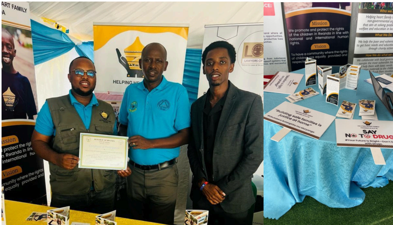
Photo of the Executive Director of Helping Heart Family Rwanda receiving a Certificate of Appreciation from the Chairperson of JADF Gasabo.

On June 23–25, 2025, Helping Heart Family Rwanda participated in the Partners' Exhibition organized by Gasabo District in collaboration with JADF. The event, held at the Gasabo District headquarters, brought together different organizations and development partners working to promote community welfare in Gasabo.