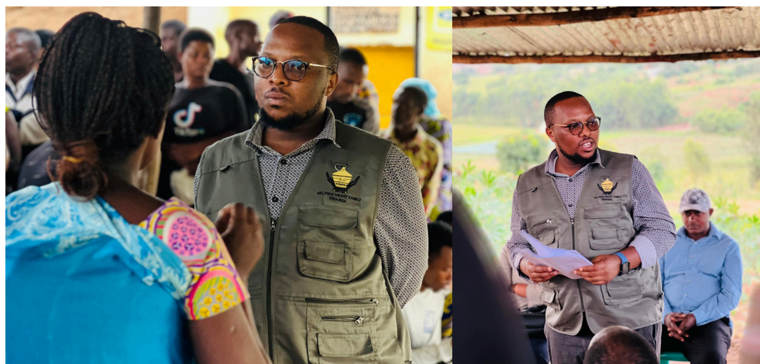
Photo: Helping Heart Family Rwanda's team engaging with women in Kinyinya Sector, listening to their challenges, and providing legal guidance on the Persons and Family Law, February 18, 2025.

On February 18, 2025, Helping Heart Family Rwanda, through Inteko Zabaturange, conducted a legal awareness session in Gasabo District, Kinyinya Sector, Murama Cell, Ngaruyinka Village. The session focused on educating the community about the newly enacted law governing Persons and Families, ensuring that individuals understand their legal rights and responsibilities.