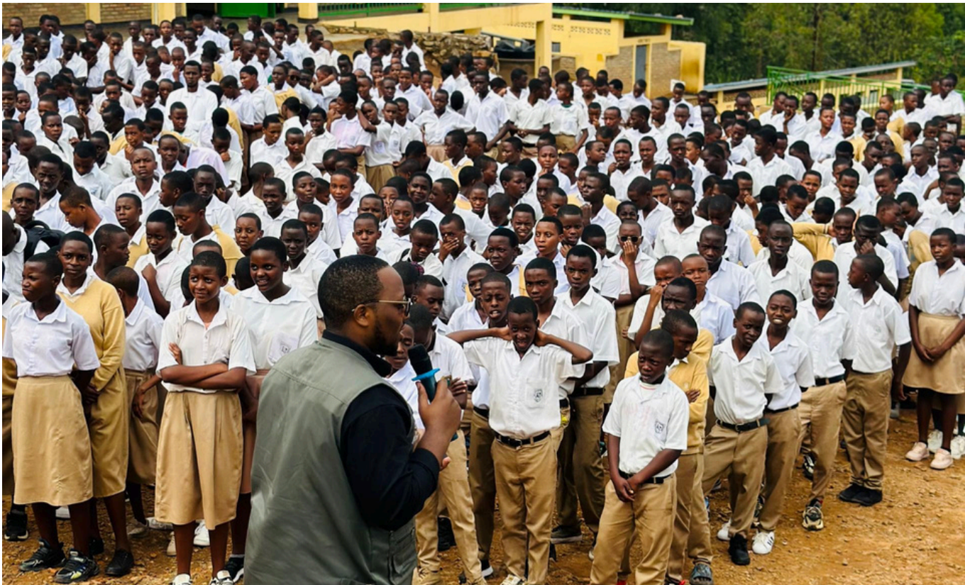
Helping Heart Family Rwanda's Executive Director explaining Gender-Based Violence to the students of GS Kagarama during the 16 Days of Activism campaign.

As part of the global 16 Days of Activism Against Gender-Based Violence, Helping Heart Family Rwanda launched an awareness campaign on November 26, 2024, at GS Kagarama, located in Kagugu Cell, Kinyinya Sector, Gasabo District. This initiative aimed to educate and empower young people and educators with critical knowledge on Gender-Based Violence (GBV), its impact, and the necessary steps for prevention and response.